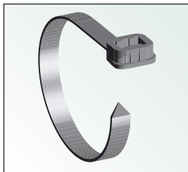
Ultra Heavy Duty Tie