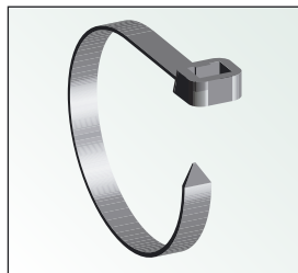
Heavy Duty Tie