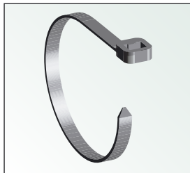
Standard Duty Tie