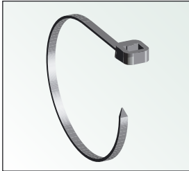
Light Duty Tie